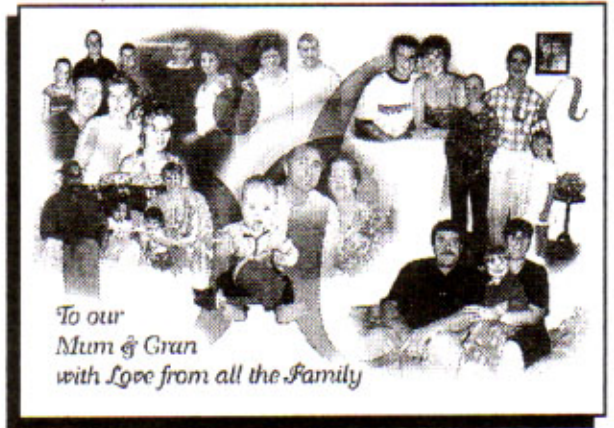
To our Mum & Gran with Love from all the Family

Any number of Photographs ; in Colour, Black & White or Sepia can be combined to create a special and totally individual gift.